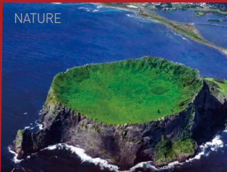
Jeju, UNESCO World Natural Heritage