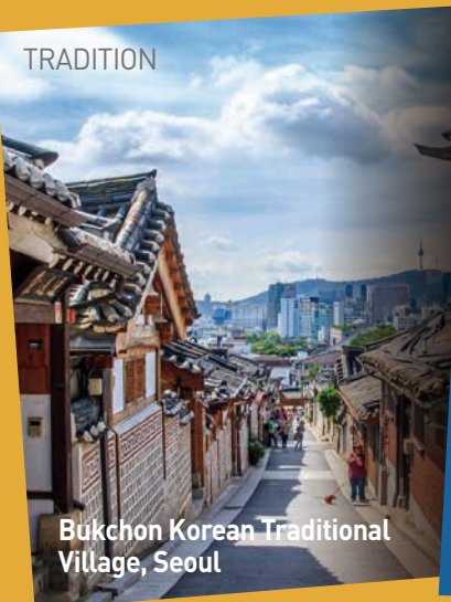
Bukchon Korean Traditional Village, Seoul