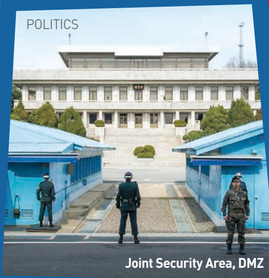
Joint Security Area, DMZ